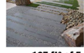
5 137 ft 2 of 5 Stepping Stones