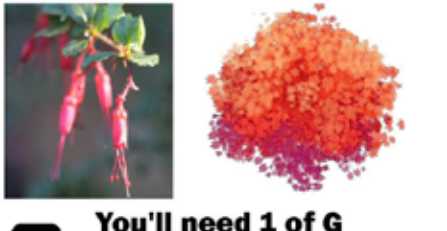
G You'll need 1 of G Fuchsiaflower Gooseberry ( Ribes Speciosum )

Sun: Full Sun Water: Very Low Growth Rate: Moderate Height: 0.2' - 1' Width: 8' Flower Color: Blue, Lavender