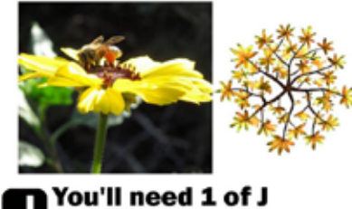
J You'll need 1 of J Bush Sunflower ( Encelia Californica )

Sun: Full Sun Water: Extremely Low, Very Low Growth Rate: Moderate, Slow Height: 3.3' - 5' Width: 3' - 5' Flower Color: White, Yellow