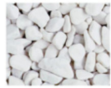
1 You'll need 40 ft 3 of 1 Planter Gravel