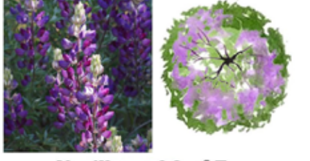
E You'll need 3 of E Silver Lupine ( Lupinus Albifrons )

Sun: Full Sun Water: Very Low Growth Rate: Moderate, Slow Height: 1.6' - 7' Width: 2' - 9' Flower Color: Brown, Pink, White