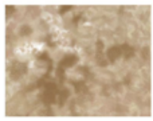
2 You'll need 87 ft 3 of 2 Mulch