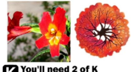
K You'll need 2 of K Red Bush Monkeyflower ( Diplacus Aurantiacus var. Puniceus )

Sun: Part Shade, Full Sun Water: Very Low Growth Rate: Fast Height: 1.6' - 5' Width: 3' - 7' Flower Color: Brown, Purple, Yellow