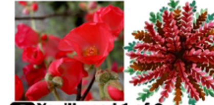
O You'll need 1 of O Desert Globemallow ( Sphaeralcea Ambigua )

Sun: Full Sun Water: Very Low Growth Rate: Moderate, Slow Height: 0.3' - 7' Width: 5' Flower Color: Yellow