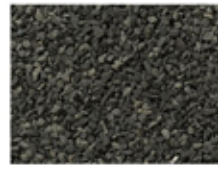
3 52 ft 3 of 3 Black Basalt (6mm)