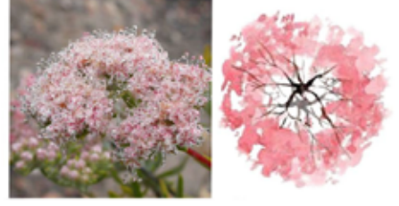
D You'll need 4 of D Santa Cruz Island Buckwheat ( Eriogonum Arborescens )

Sun: Part Shade, Full Sun Water: Very Low, Low Growth: Fast Height: 3' - 6.6' Width: 3' - 6' Flower Color: Red