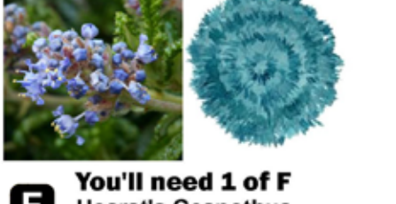
F You'll need 1 of F Hearst's Ceanothus ( Ceanothus Hearstiorum )

Sun: Full Sun Water: Very Low Growth Rate: Fast Height: 3.2' - 5' Width: 2' - 3' Flower Color: Blue, Lavender, Purple