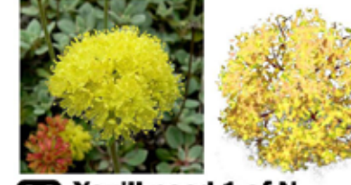
N You'll need 1 of N Sulphur Buckwheat ( Eriogonum Umbellatum )

Sun: Full Sun Water: Very Low Growth: Fast, Moderate Height: 0.7' - 1.5' Width: 3' Flower Color: Cream, Pink, White, Red