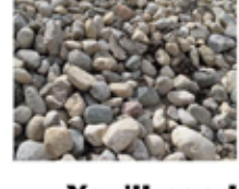
6 You'll need 22 ft 3 of 6 Dry River Bed