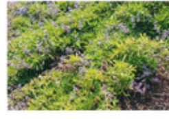
4 You'll need 231 ft 2 of 4 Creeping Black Sage