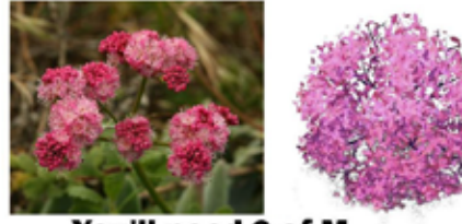
M You'll need 3 of M Red-flowered Buckwheat ( Eriogonum Grande Var. Rubescens )

Sun: Full Sun Water: Extremely Low Growth Rate: Fast Height: 1' - 5' Width: 4' Flower Color: Brown, Yellow