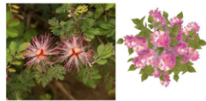
H You'll need 3 of H Fairyduster ( Calliandra Eriophylla )

Sun: Full Sun Water: Low Growth: Slow, Moderate Height: 1' - 3' Width: 3' Flower Color: Purple, Pink