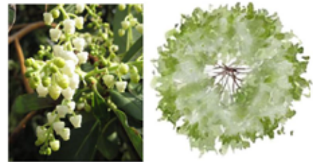
A You'll need 1 of A Pacific Madrone ( Arbutus Menziesii )

Sun: Part Shade Water: Low Growth Rate: Slow Height: 15' - 100' Width: 5' - 25' Flower Color: White, Red