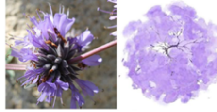
B You'll need 1 of B Cleveland Sage ( Salvia Clevelandii )

Sun: Part Shade Water: Low Growth Rate: Slow Height: 15' - 100' Width: 5' - 25' Flower Color: White, Red