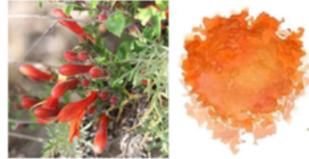
C You'll need 1 of C Climbing Penstemon ( Keckiella Cordifolia )

Sun: Part Shade, Full Sun Water: Very Low Growth Rate: Fast, Moderate Height: 3' - 4.5' Width: 8' Flower Color: Blue, Purple, Lavender