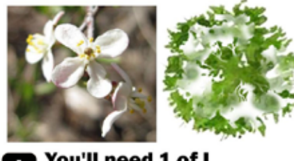
I You'll need 1 of I Bush Rue ( Cneoridium Dumosum )

Sun: Full Sun Water: Low Growth: Slow, Moderate Height: 1' - 3' Width: 3' Flower Color: Purple, Pink